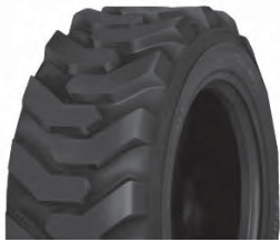
SKS H.D. TRAC LOADER GRIPPER & XTRA WALL