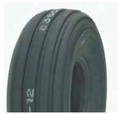
INDUSTRIAL RIB F-3