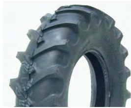
TRACTION IMPLEMENT I-3