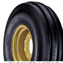
FARM TRACTOR R-1 BIAS