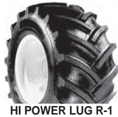
HI POWER LUG R-1