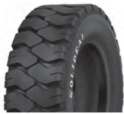
EXTRA DEEP INDUSTRIAL PNEUMATICS