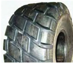
TURF TRACTION R-3