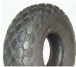
FLOATATION IMPLEMENT DIAMOND TREAD I-2