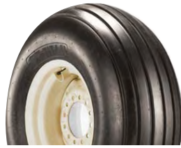
HI-FLOTATION RIB IMPLIMENT I-1