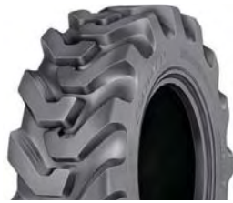
PNEUMATIC TGRADER & BACKHOE