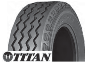
TITAN INDUSTRIAL CONTRACTOR F-3