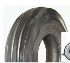
FARM FRONT F2M FOUR RIB