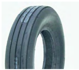
MULTI RIB IMPLEMENT I-1