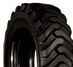
LOADER L-2 AND L-3