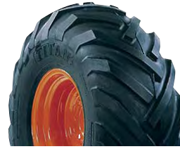
TRACTION IMPLEMENT I-3