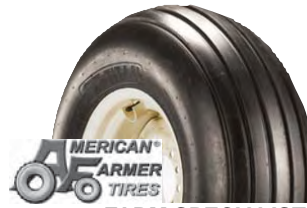
AMERICAN FARMER TIRE FARM SPECIALIST I-1 RIB IMPLEMENT