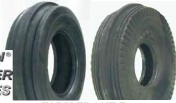
FARM FRONT F-2 TRIPLE RIB